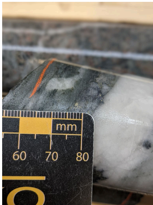
Figure 1 Visible Gold, TR-23-03, Downhole Depth of 59.72 m

Total drilling completed as of January 27, 2022, is 669.0 m. Field geologists logging core have noted visible gold in holes TR-23-03 at a depth of 59.72 m and TR-23-04 at a depth of 70.87 m as shown in Figures 1 and 2 below. TR-23-04 was drilled as an undercut below TR-23-03. Core is being logged and selected core will be sent for assaying.